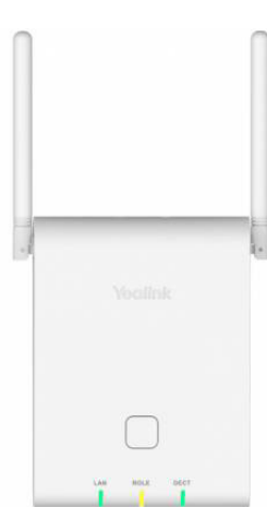
DECT IP Multi-Cell Base Station W90B