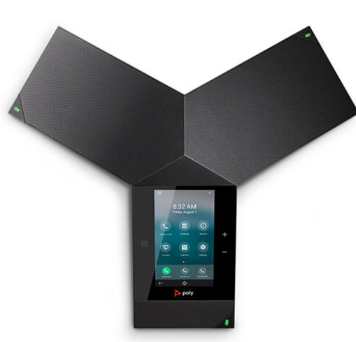
Poly Trio 8300 Conference Phone